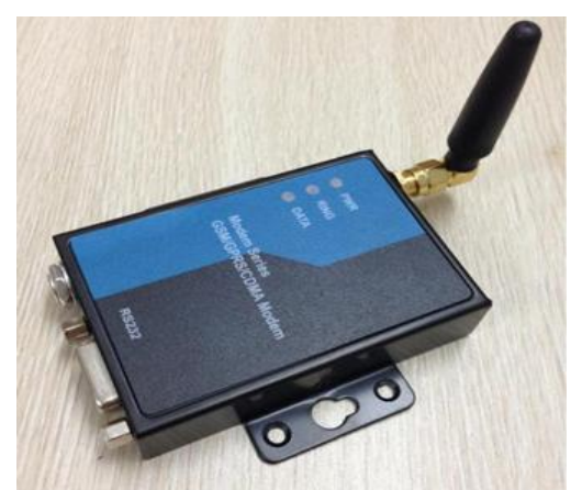
Figure 1.6: GSM Module RS-232

This Global System modem is capable of accessing any SIM network operator and yet can play as a unique SIM number and a mobile phone at the same time. RS-232 protocol is used because it can easily connect to the controller and is integrated via GSM modem. It also sends and receives SMS and make calls. This GSM module is run by 900/1800 megahertz (MHz). It features an LED light buzzer and is protective against tripping voltages.