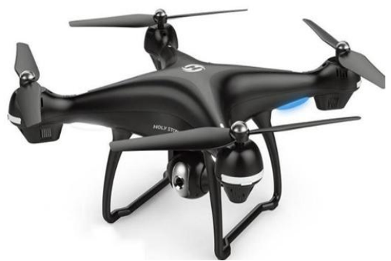
Figure 1.3: HS100 GPS FPV

surveillance. This machine is an intelligent remotecontrolled quad copter, fitted with the latest GPS tracking system. The HD 2K camera captures the high-quality aerial footage. Fitted with latest technology of "follow me", this feature make sure the quad copter stays above the user while capturing the movements and keeping track of the user.