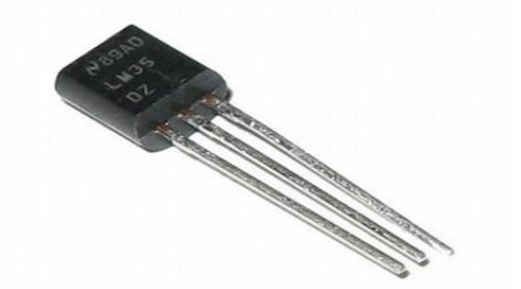
Figure 1.7: Temperature Sensor LM 35

is proven to be useful in agriculture. LM 35 can take up to +150 degrees to -55 degrees.