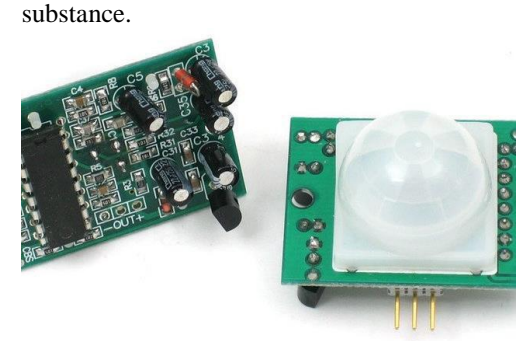
Figure 1.9: PIR Sensor

PIR sensors are applied to the central system because they can detect moving objects such as animals, insects and even human beings. The most common uses of PIR sensors are lighting systems and burglar buzzer systems. If a person walks into the field at that time the temperature would increase from normal temperature. The detection of moving objects is triggered when the output voltage is changed due to movement changes caught by the senor. Every object which has an absolute null temperature transmits energy in the form of heat radiations. Human eye cannot see such infrared waves of radiation. These sensors detect the infrared radiations reflected from the moving