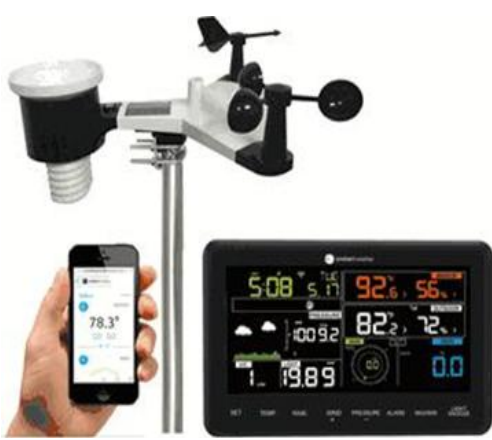
Figure 1.4: WS-2902A

Ambient Weather WS-2902A allows monitoring the atmospheric stipulation which is easy enough to notice with best colour display experience instilled with the LCD. The latest Wi-Fi connectivity allows the transmission of data to the biggest weather station of the world. It gives the contrivance connection between local weather conditions by transmitting the data over internet using smart phone, computer or tablet directly to the end user. The interlinked weather forecasting station measures humidity in air, temperature, and direction of wind, solar radiations, UV and speed of wind.