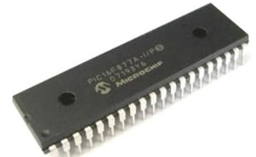
Figure 1.5: Microcontroller PIC-16F877A

removed because of memory flash. Many different industries provide a massive range of applications. This could also be implemented in home appliances, security, industrial advancement and remote sensors. The frequencies, transmitter codes and other related data is also received and stored in a featured EEPROM.